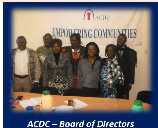
ACDC – Board of Directors